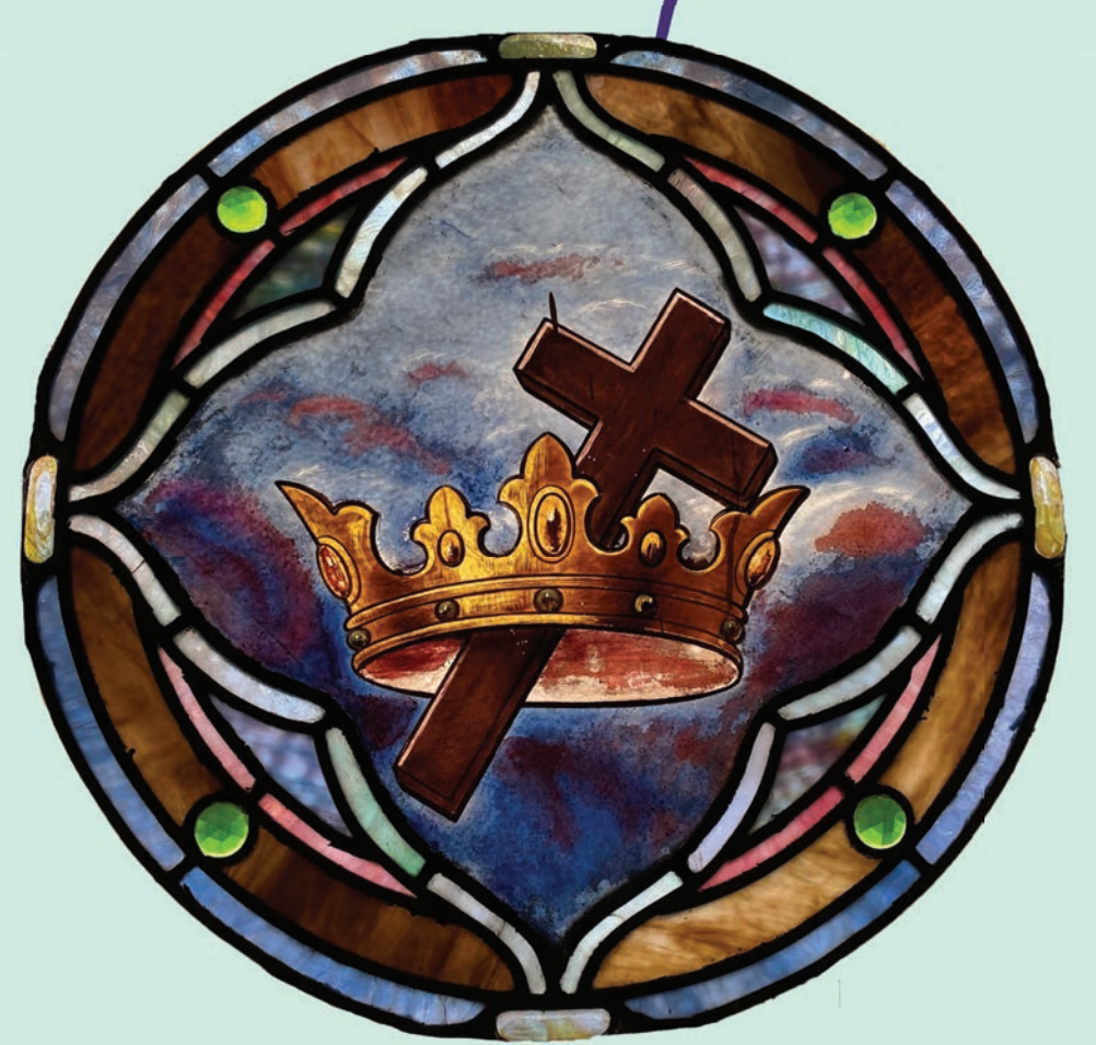
Divine Mercy Sunday