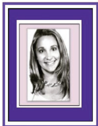
Meet Our Speaker