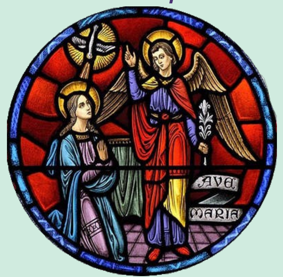
The First Sunday of Advent