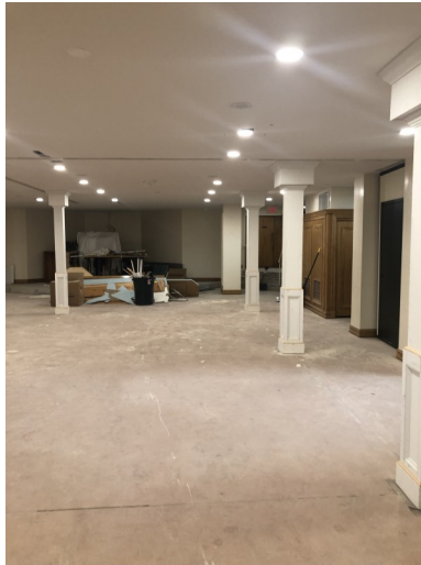
The carpets have been removed in preparation for the new flooring .