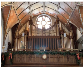
Austin Opus 2786, Decorated for Christmas

In 2004 our Parish installed a custom Austin Pipe Organ to replace the one that had been in service for over 100 years. Unfortunately the original digital organ chimes on the organ are no longer functioning.