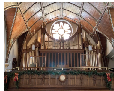
Austin Opus 2786, Decorated for Christmas

(203) 227-5161. For more history, photos and information about the organ, visit our website: assumptionwestport.org/organ